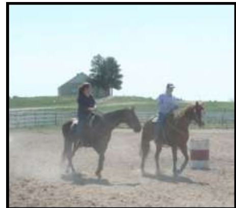
CST Gymkhana Warm Up 2008

Rain Dates September 11th & 12th September 18th & 19th