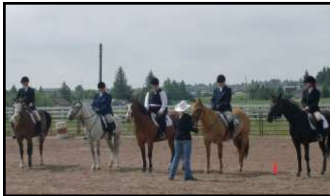
CST English Horse Show 2009

Horse Shows Registration at 8:00 AM and begin promptly at 9:00 AM: